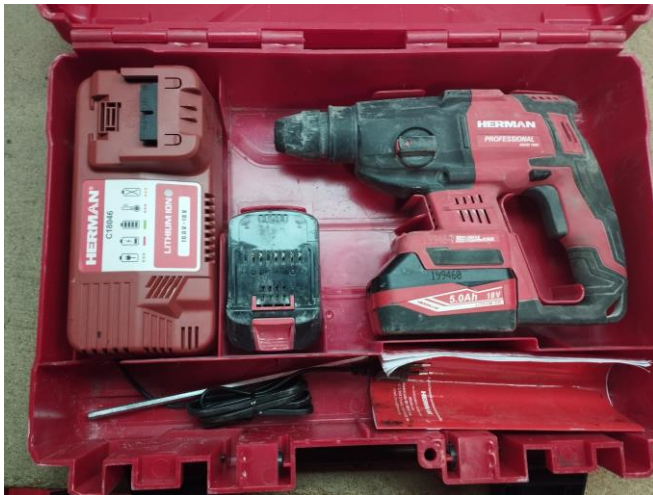
Obr.1 Stav náradia pri prijme