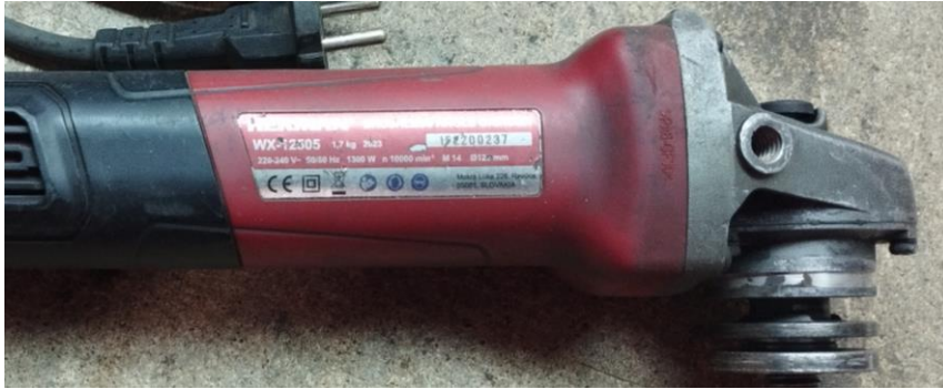
Obr.1 Stav náradia pri príjme